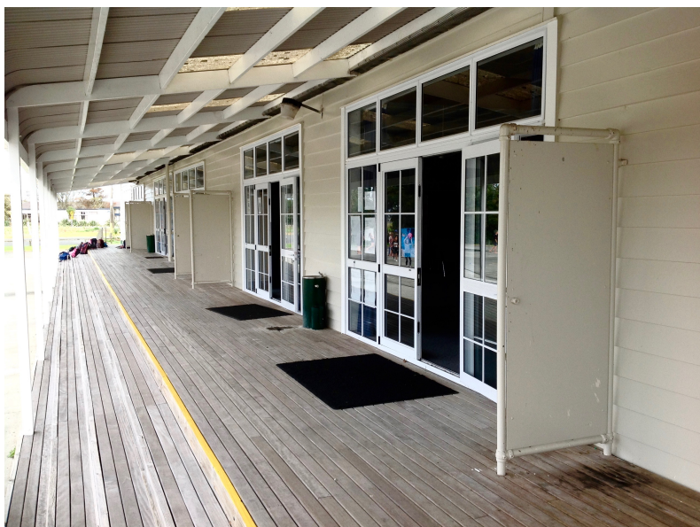
This shows the panels along the school front that will be used for the murals and need to be sanded