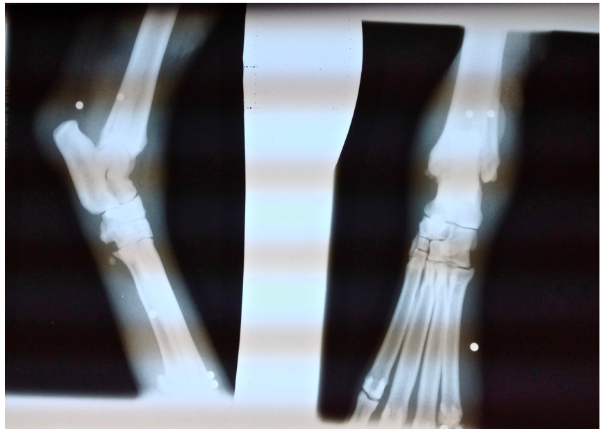
X-ray showing the shotgun pellets in the dog's leg. The round white spots are the pellets.